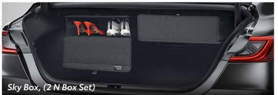
Sky Box, (2 N Box Set)