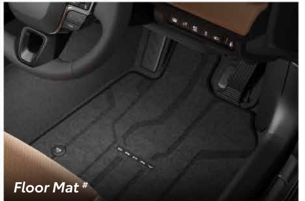
Floor Mat #