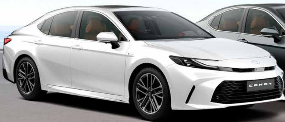
089 Platinum White Pearl