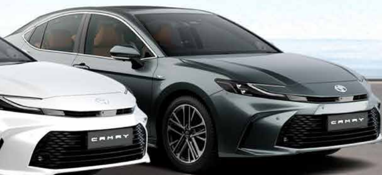
1L5 Precious Metal