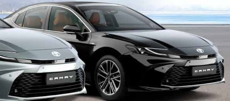
218 Attitude Black