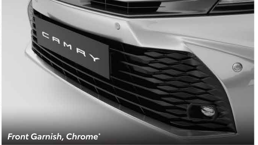
Front Garnish, Chrome*