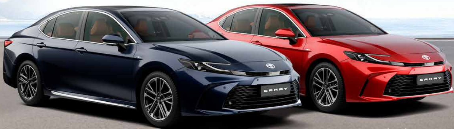
8x8 Dark Blue