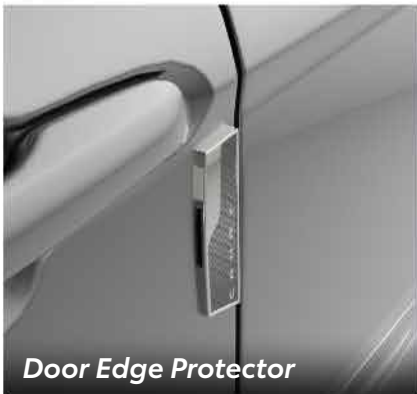
Door Edge Protector