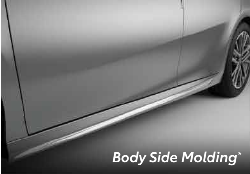
Body Side Molding*