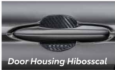
Door Housing Hibosscal