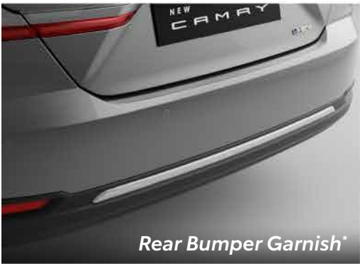
Rear Bumper Garnish*