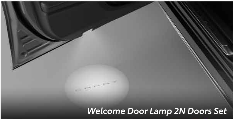
Welcome Door Lamp 2N Doors Set