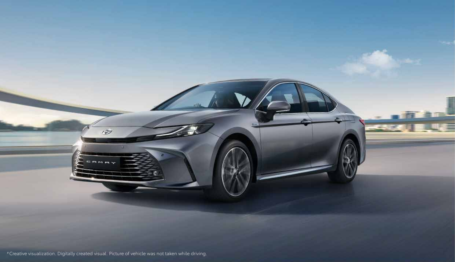
* Creative visualization. Digitally created visual. Picture of vehicle was not taken while driving.