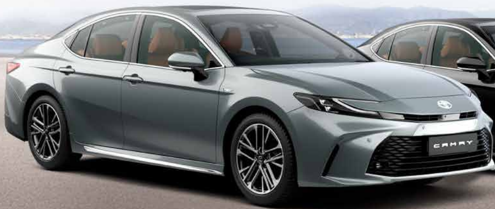
1H5 Cement Grey